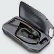
Charging case (Sold separately)