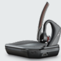
Charges while docked